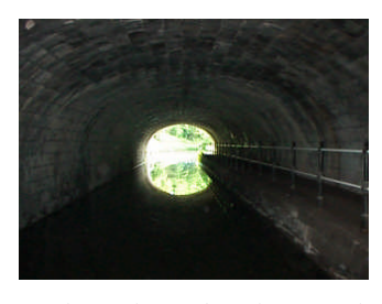
Inside the boat